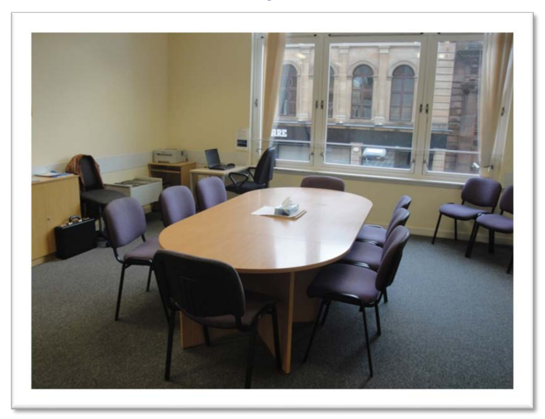
After – the Pilot Hearing Room

Before – it was a 'standard' Hearing Room